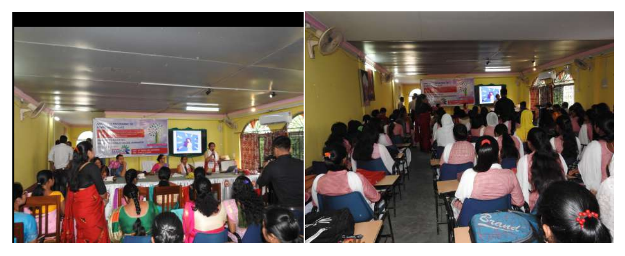
Awareness Programme on Womwn Health Care