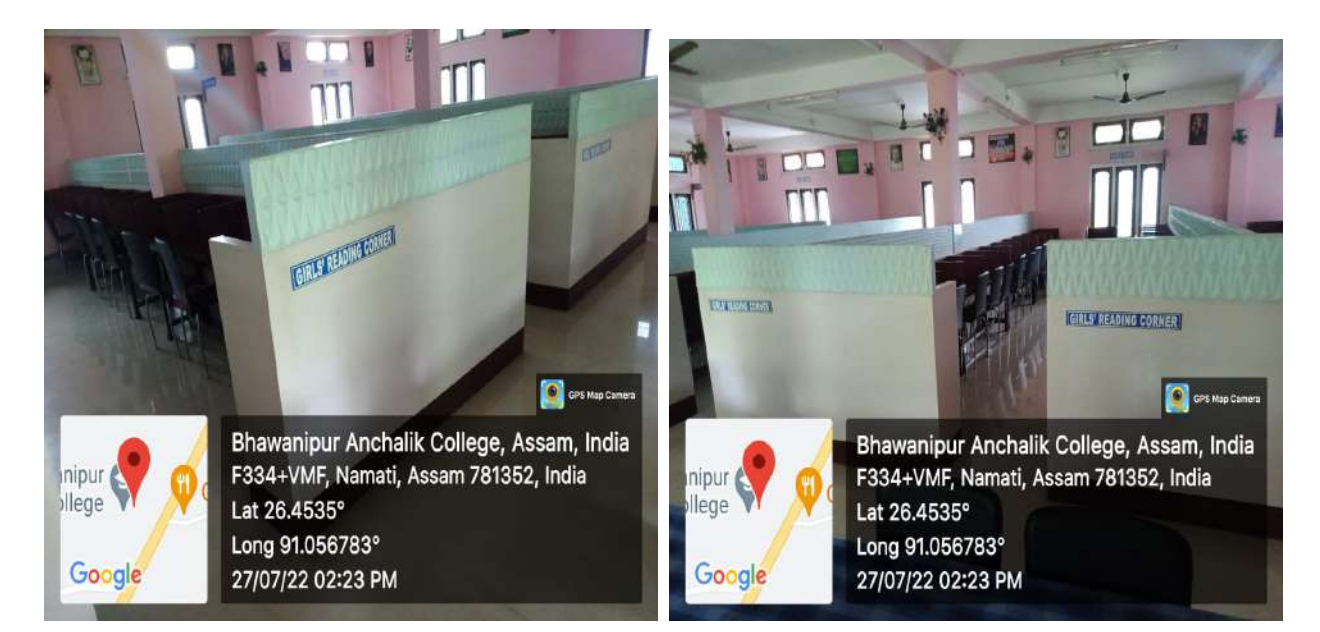
Separate Reading Room facility for Girls Students