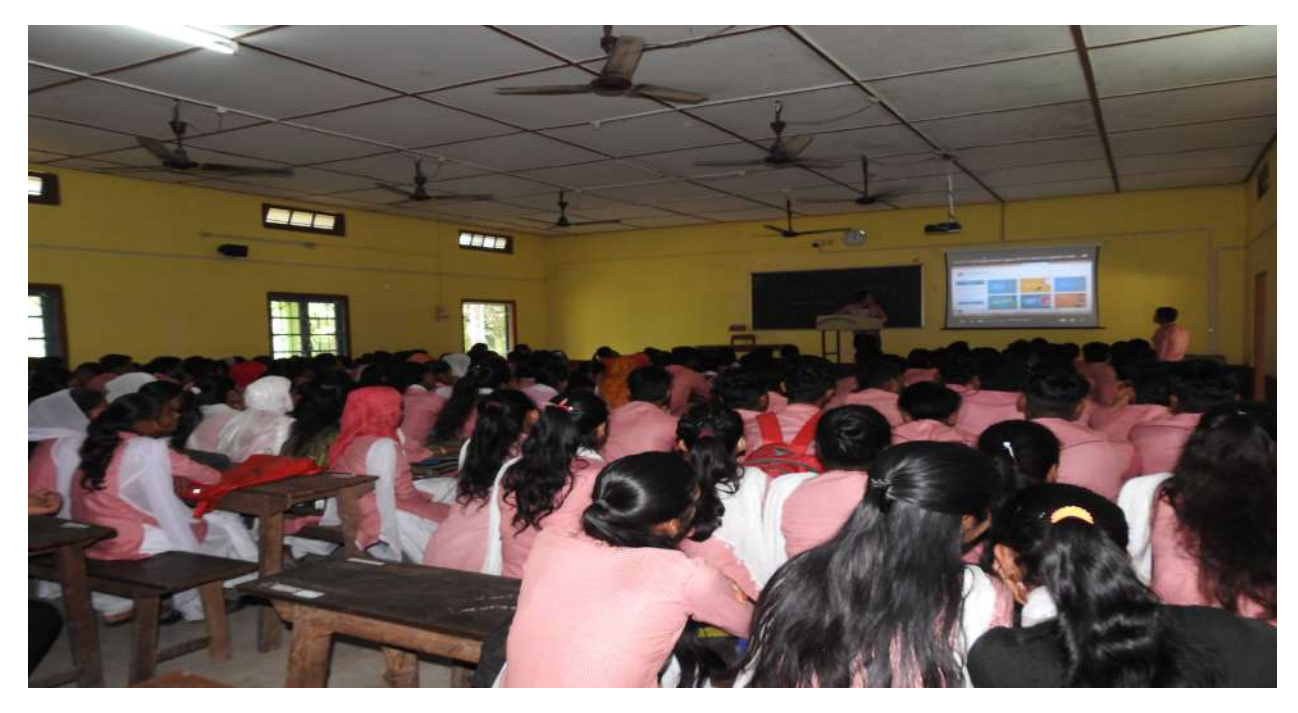
Voter's Awareness Programme