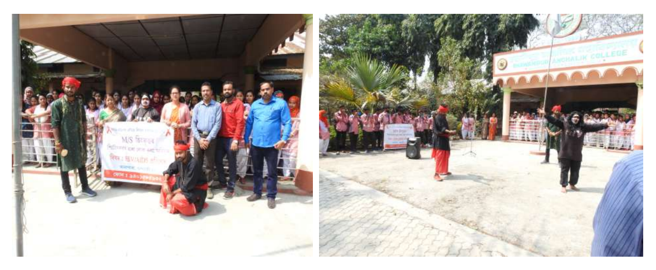
Awareness Programme on HIV/AIDS