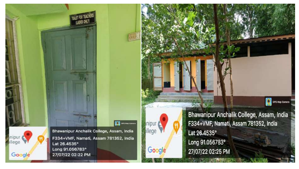
Women Toilet (Within Classroom Campus)